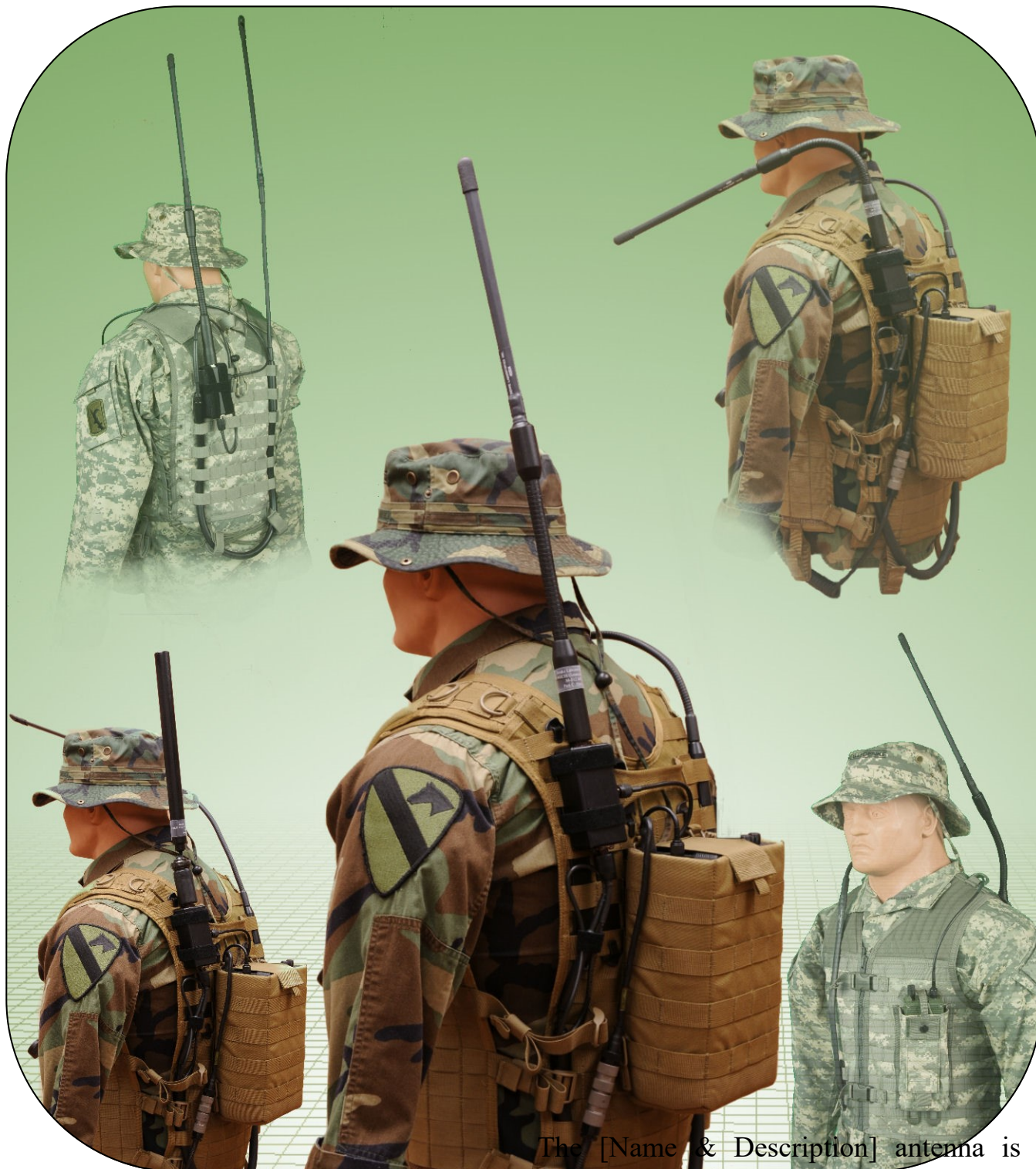
The [Name & Description] antenna is de-